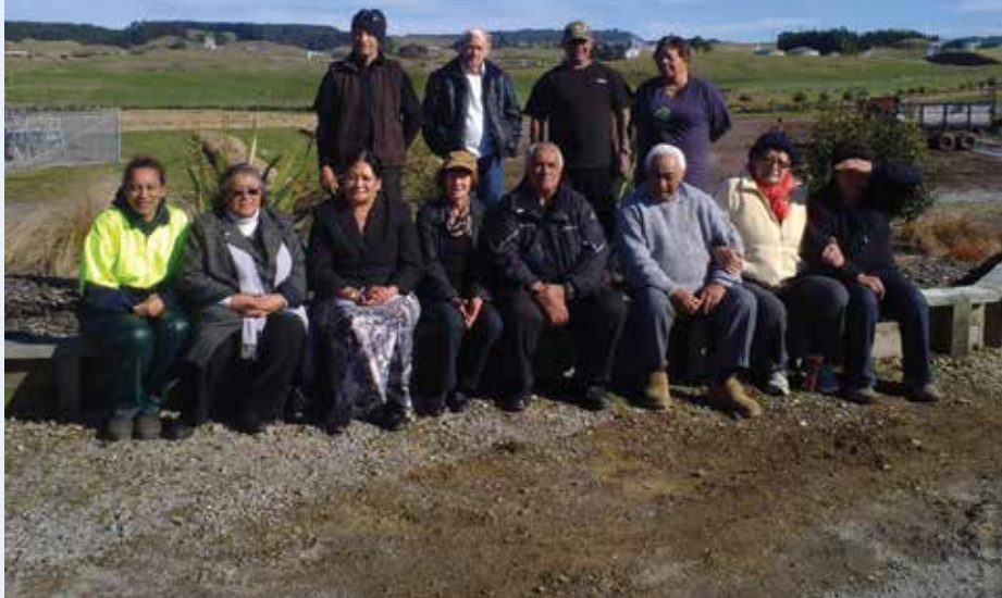
People involved with waste management processes at Mokai.