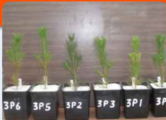
Above: Radiata pine seedlings during the pot trial.

The results from our long-term biosolids trial at Rabbit Island in Nelson have demonstrated that repeated biosolids application over 14 years significantly improved soil fertility, tree nutrition and site productivity, significantly increased C sequestration in the forest and soil, and had no significantly detrimental impact on groundwater and soil qualities.