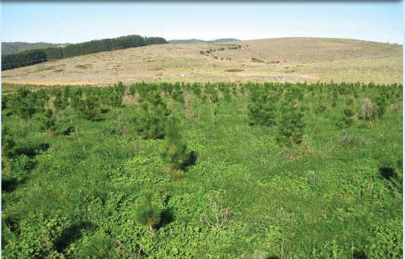
Above: Photo of the Rotowaro remediation area. The biosolids trial area is in foreground, and the fertiliser-only area is in the background.