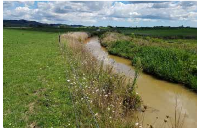
Drain in the Nikau Farm around which the experimental plots are being planted.

Due to several stakeholders who have interest in restoring the health of Lake Waikare, and the numerous plantations of native vegetation that WRC and the local Iwi are undertaking in the margins of the lake, we decided to further explore how these riparian plantings could contribute to their general expectations. We obtained a project funded by the Vision Mātauranga Capability Fund – MBIE, to measure the benefits of riparian vegetation restoration on the health and wellbeing of Lake Waikare for the whānau hapuu Iwi and communities of the Lower Waikato Region.