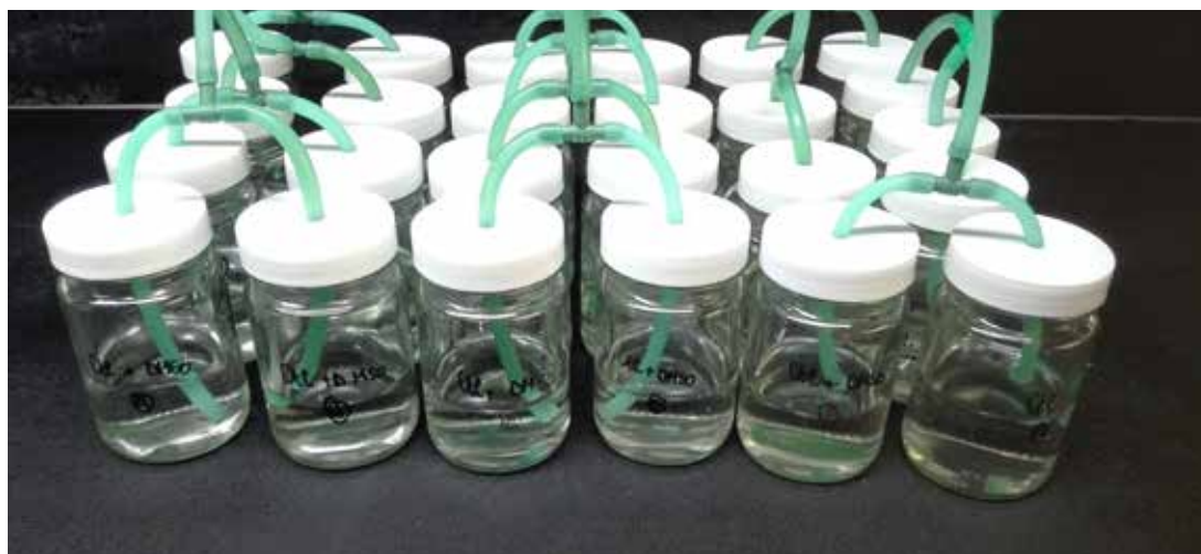
Figure 2: Experimental set up for the copepod multigenerational experiment.

If you would like to subscribe to this newsletter please email Izzy.Alderton@esr.cri.nz with your contact details.