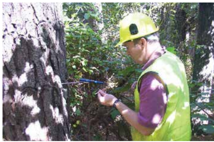
Figure 1: Effect of repeated biosolids application on tree growth (left) and taking wood density measurements (right) of radiata pine at Rabbit Island in Nelson