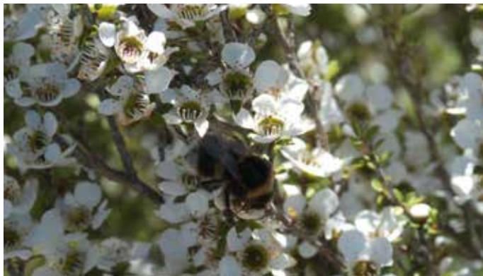
Kānuka, to be planted around The Pot.