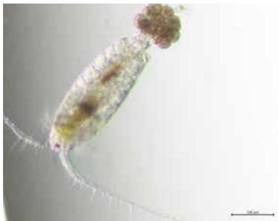
Figure 1: Photo of a female Gladioferens pectinatus with the egg sack.

CIBR is working closely with Olga Pantos from ESR on the planning of a workshop to discuss risk and management of plastics. There is much interest and concerns around the risk of plastics including increasing media coverage, e.g. Auckland Council are looking at developing policies and other groups like Gisborne District Council would like more info. Olga will use an approach similar to the emerging contaminants workshop held in Wellington last December. She has secured internal ESR funding and we are currently working to explore other funding options. We are identifying key people that should be approached to attend the tentative workshop next December. David Weller (EPA) and Sarah Fish (MfE) are contributing to the process and have vested interest in the risk of plastics. There are many community driven initiatives. Andrew Jeffs (U Auckland) has interactions with Sustainable Coastlines, a community group trying