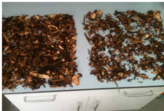
Figure 1: Macrocarpa mulch at the application rate of 8 and 4 litres/m 2

Applying up to 5 litres/m 2 is practical if fine mulch is used. A coarser mulch can also be used if mowing height can be increased to above 80 mm, and preferably 100 mm (our lawn mower blades couldn't be lifted higher than 80 mm). The trial helps support applying tree prunings from parks over grassed areas used for passive recreation (not playing fields) to avoid transport and disposal costs and is likely to deliver local ecosystem benefits; indeed, motorways now routinely spread mulched prunings straight back onto adjacent batters. Best results are likely