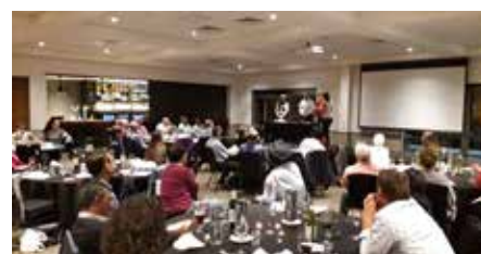
Conference dinner and awards