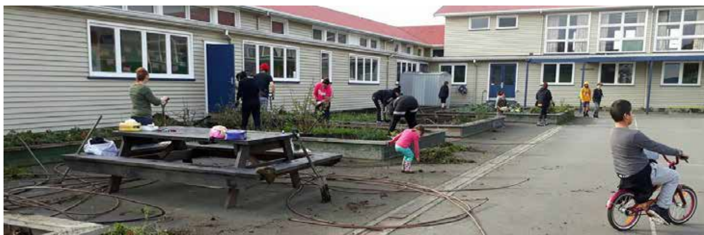
Te Pā whānau weeding the māra kai.