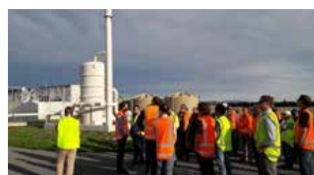
Pines Wastewater Treatment Plant, NZ LTC Conference field trip 31 March 2017