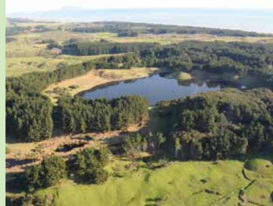
Aerial view of 'The Pot' wastewater pond at Levin

The CIBR Social and Cultural team have published their excellent research on Tapu to Noa in the EPA Te Pūtara which is widely distributed to the Te Herenga (Māori National Network). Look out for the article entitled "Tapu and Noa – Critical constructs for management of biowastes in NZ".