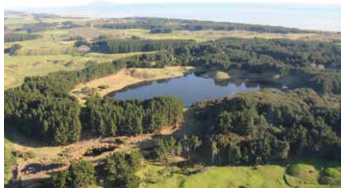
Aerial view of 'The Pot' wastewater pond

In this project, we will replace 10 ha of pine forest with native ecosystems comprising 40-60 % mānuka and kānuka. The mānuka/kānuka will form a contiguous mosaic interspersed with other native species that were common in this area before the land was cleared,