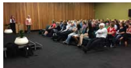
Conference venue at the Christchurch City Council

The planning is well underway for the 2018 LTC conference. It is to be held in Rotorua from 7 - 9 March 2018. The venue, international speaker and field trips will all soon be confirmed.