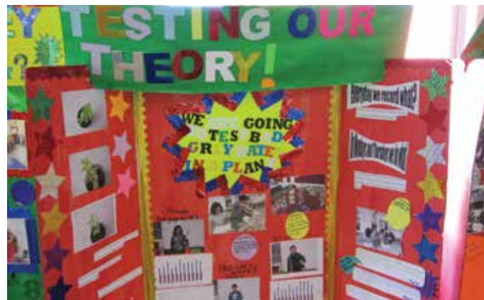
Results boards from the greywater experiment

The students monitored their kōhūhū plants ( Pittosporum tenuifolium spp. Colensoi , supplied by Mark Ross of Whenua.biz) throughout the experiment for any changes in appearance, taking note of leaf colour, leaf number, stem height and appearance. Plants were harvested at the end of the experiment and roots washed to remove soil/potting mix. The root-mass of each replicate was calculated by weighing at the conclusion of the experiment.