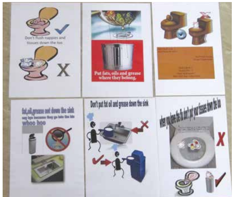
Posters displayed in the marae to provide information for the community and visitors on caring for the septic tank system and the environment