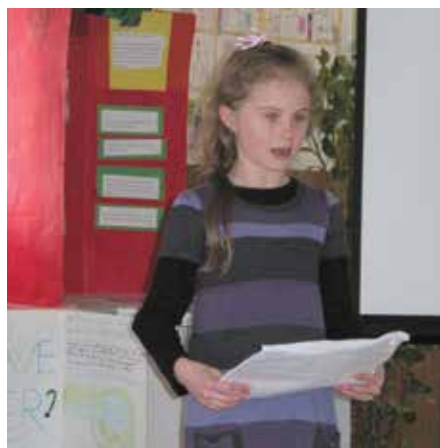
Presentations by Tirohanga School students