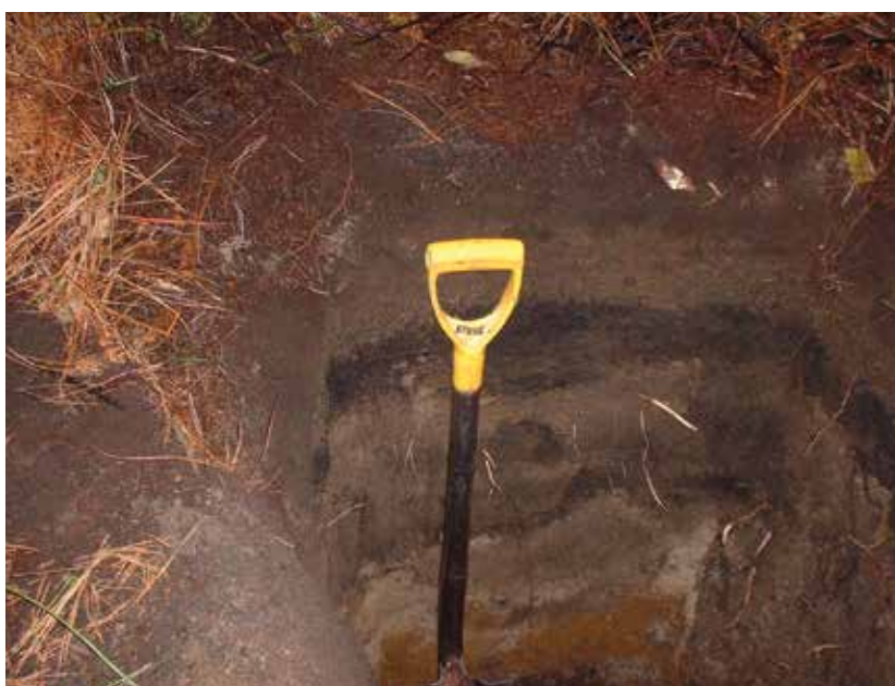
Soil sampling on Rabbit Island