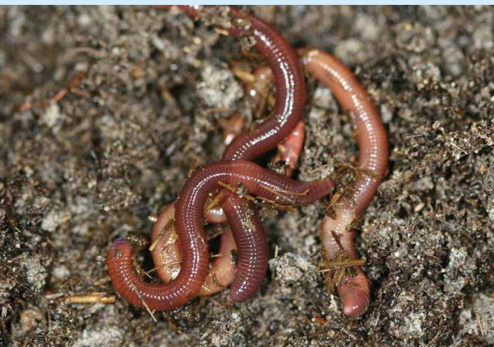
Above: Eisenia andrei worms – a typical test species in ecotoxicology