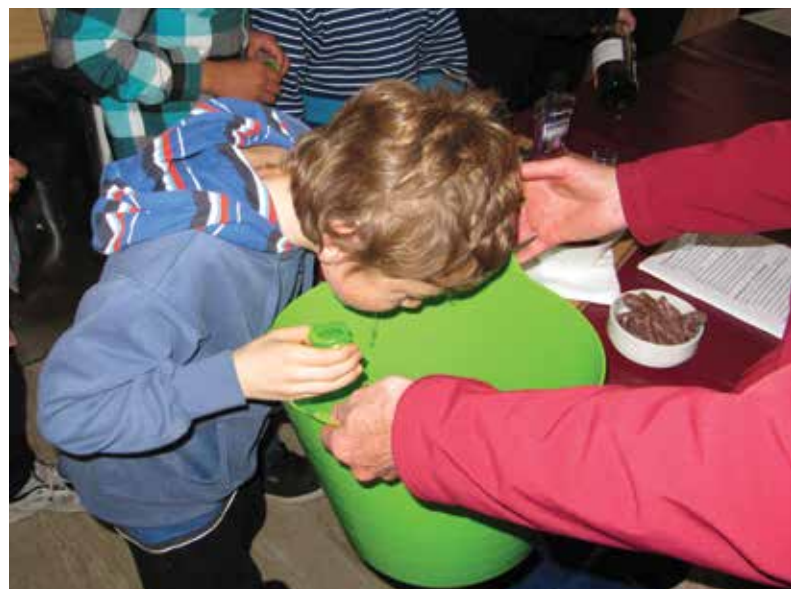
A Tirohanga school student tries a traditional natural mouthwash