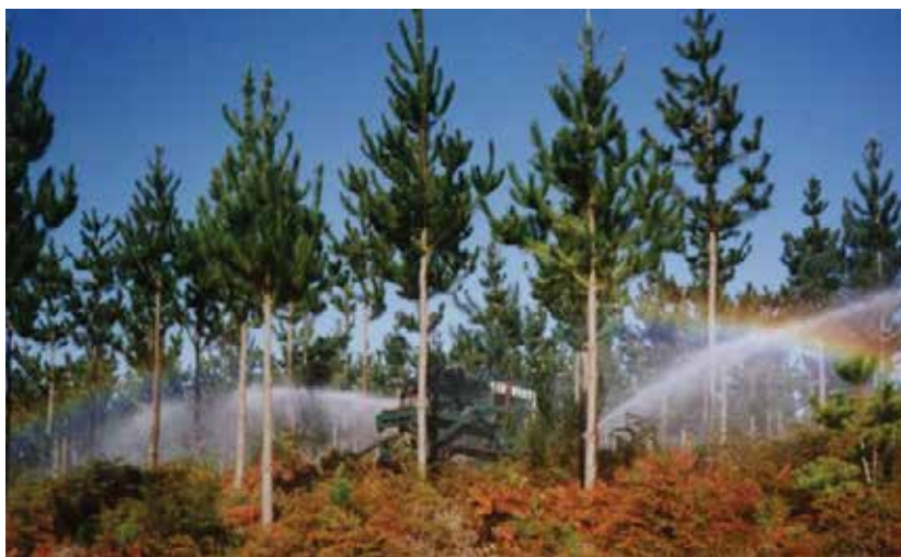
Biosolids application on Rabbit Island

Biosolids application significantly increased foliar N concentration, tree stem volume growth and total forest C stocks (data not shown). In July 2013 when the trees were aged 22 years, the stem volume was 27% and 21% greater in the High and the Standard treatment respectively when compared to the Control