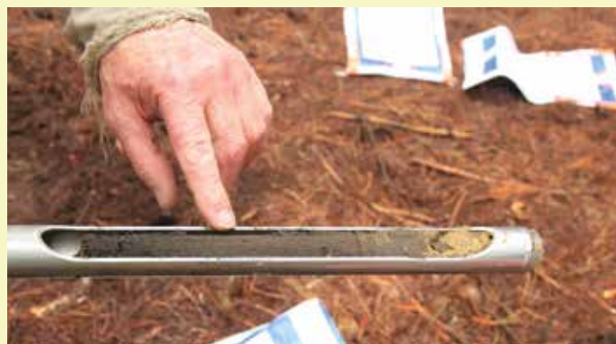
Sampling in this way can reveal where substances of interest are found along the soil profile. Note the two distinct colours in this 0-25 cm sample.

The trial was set up in 1997 and has had six biosolids applications with the latest in November 2012. All 36 plots were sampled at 25 cm increments down to 100 cm to track the fate of the constituents of the biosolids. We are especially interested in where the biosolids-derived nutrients and heavy metals currently sit along the soil profile. In the 2010 soil sample the metals were found at a depth of 50 cm. We are awaiting the most recent results, which we will present in the following newsletter.