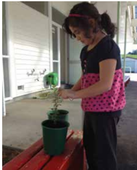
Students adding greywater to their plants