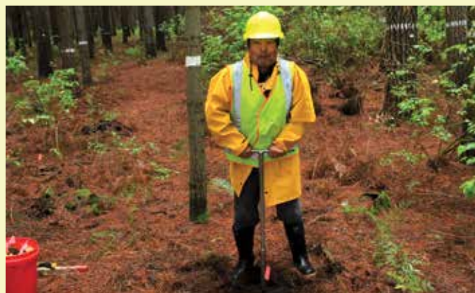
Tiancai was happy to lend a hand.