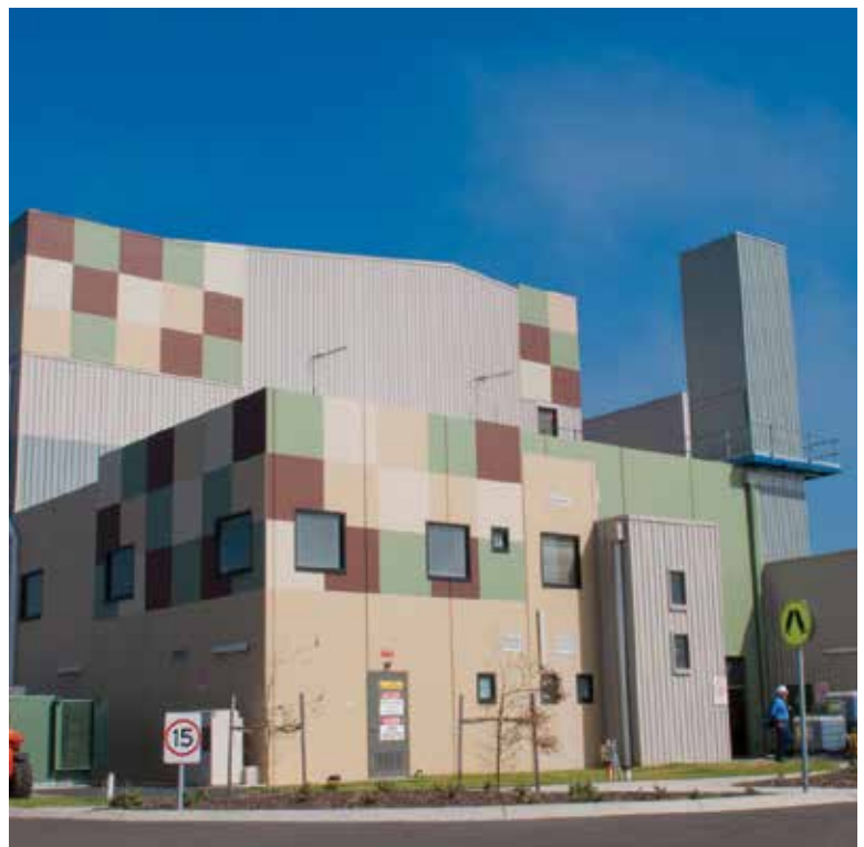
Biosolids thermal drying facility

The project required Plenary to search internationally for the most reliable and environmentally sustainable technical solution for the treatment of some 60,000 tonnes of dewatered biosolids each year. To ensure the technology was suitable, a pilot plant was imported to test the performance and operation of the drying technology under local conditions.