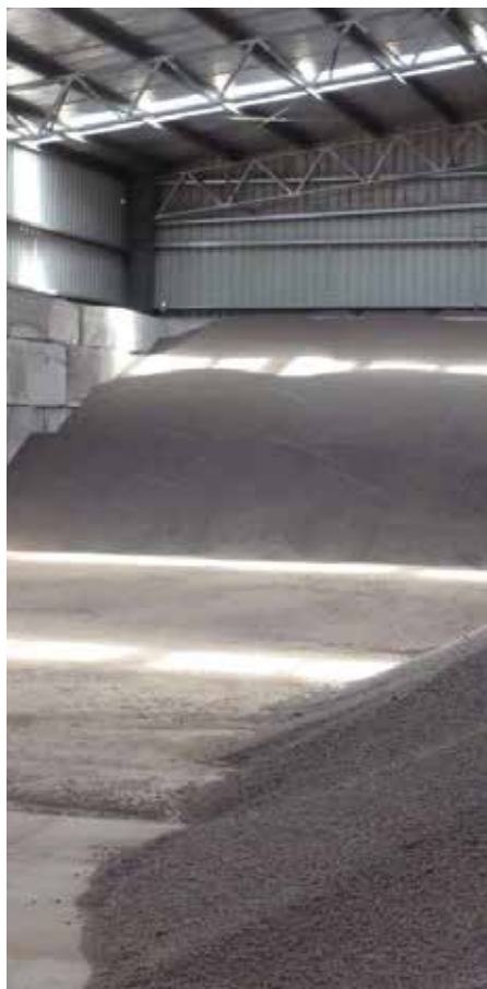
Biosolids pellets stored ready for distribution

The Plenary solution also involves the beneficial use of treated biosolids. Currently, pelletised biosolids are dispatched from the facility to more than 40 broad acre cropping and pasture farms across central and western Victoria.