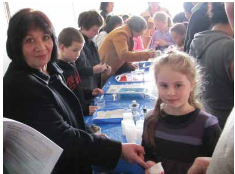
Students got to make their own environmentally-friendly personal care products like foot powder